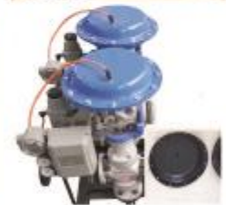
Temperature Regulate Unit