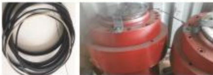
Hydraulic Cylinders and Seals