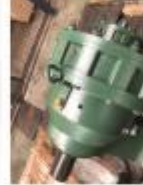
Reducers and motors